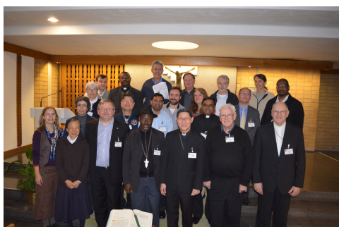
CBF member institutions worldwide

The regional and subregional coordinators have the task of promoting biblical pastoral ministry in their own regions and of coordinating it with the support of the General Secretariat. All the coordinators work on a voluntary basis.