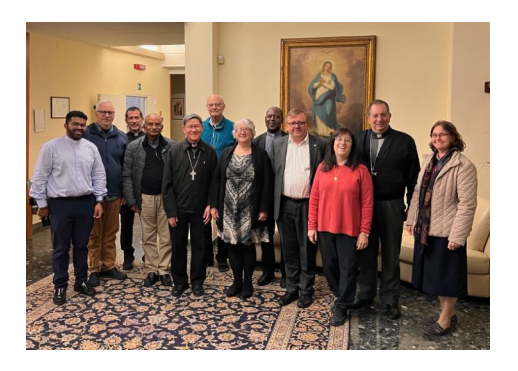
CBF member institutions worldwide

The regional and subregional coordinators have the task of promoting biblical pastoral ministry in their own regions and of coordinating it with the support of the General Secretariat. All the coordinators work on a voluntary basis.